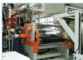
High grade PET production line