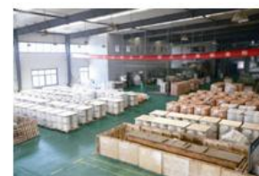
Finished goods warehouse