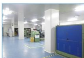
Class 100,000 purification workshop