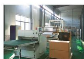
PC polycarbonate film workshop