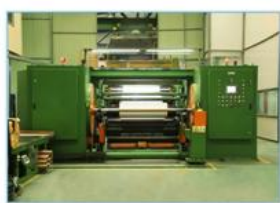
PVC film production line